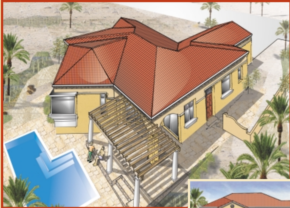
Artist rendition. Actual construction may vary. See models.