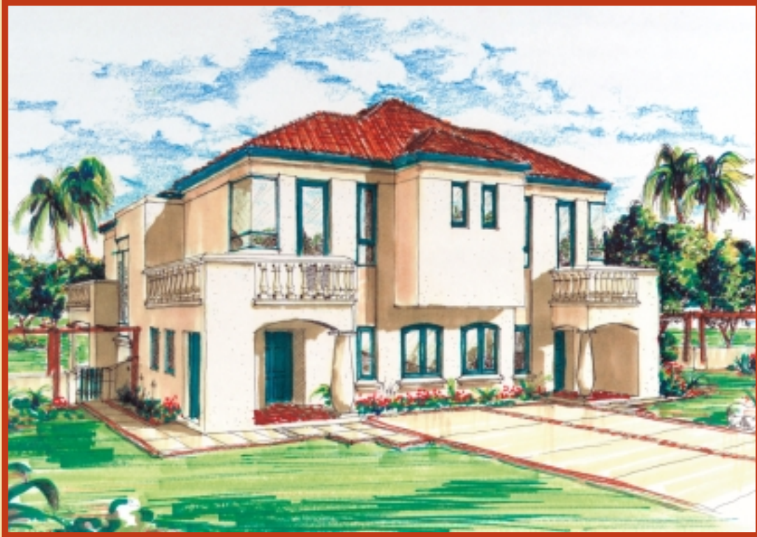
Artist rendition. Actual construction may vary. See models.

"The Sabal is a townhouse-styled condominium with just two, two-story homes side by side. Downstairs is a spacious, open living/dining/kitchen area with half bath, leading to a covered terrace and private courtyard, suitable for your optional Jacuzzi and barbeque. Upstairs, the primary master suite offers a large balcony with ocean views, abundant closet space, and a sumptuous master bath with separate tub and shower.